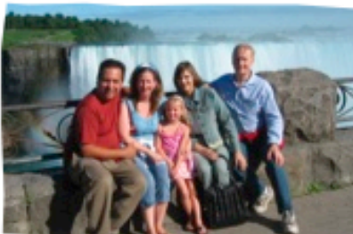
Labor Day Weekend Niagara Falls, Ontario Canada