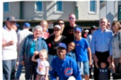
Family Outing to a Cubs Game Chicago, IL