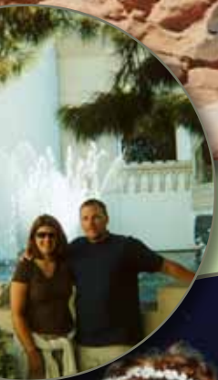
Our wedding reception