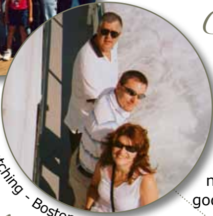
Whale watching - Boston