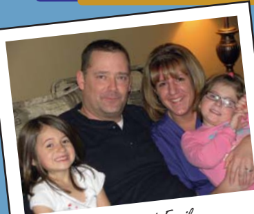
Friends and Family

We will raise our children in a warm and loving Christian home with the values we were taught as we grew up. We get excited about each holiday and all the joy it brings. We enjoy decorating the house inside and out. As a couple we share a combination of holiday traditions and we are looking forward to creating new traditions as our family grows.