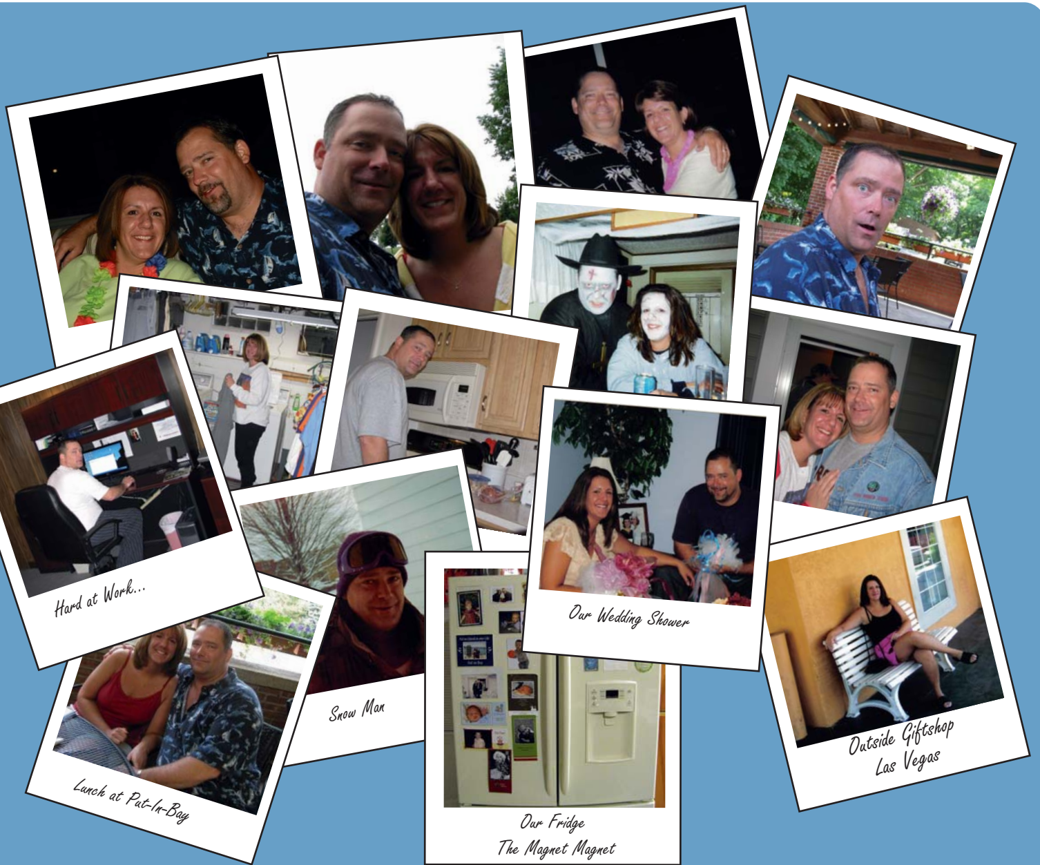
Hard at Work...