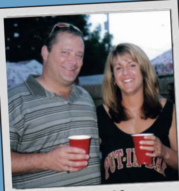
Our First BBQ 2004

The thing we look forward to the most is raising our family. We are both excited with the prospect of helping our children grow and engaging in activities such as music, soccer, baseball and the scouts or whatever it is they grow to love.