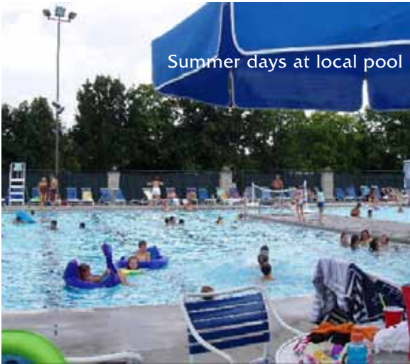
Summer days at local pool