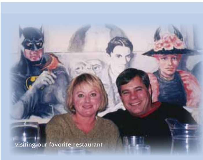
visiting our favorite restaurant