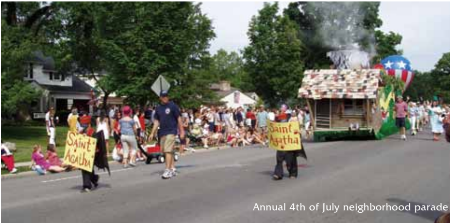
Annual 4th of July neighborhood parade

Our two families are very supportive of the different milestones each family member reaches, from that first tooth to graduating high school. We get together to celebrate as much as we can, it is a time to cook a lot of food, share pictures and stories; along with learning about upcoming events – a real time to be proud of every family member’s achievements.