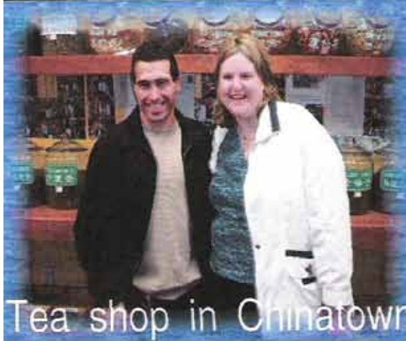
Tea shop in Chinatown

After graduating from high school, I attended college and then law school and I earned my law degree in 1996. Upon passing the Ohio Bar examination, I went into private practice for 5 years until we moved to our current home. At that time, I worked as a public defender until I obtained my current position as a Magistrate at the Juvenile Court in the county where we live. I have been a Magistrate for over 6 years and really enjoy working with children on a daily basis though it is often very challenging as well as rewarding. My employer is very supportive of our decision to adopt a child and believes that family comes first which will allow flexibility with my schedule when I return to work.